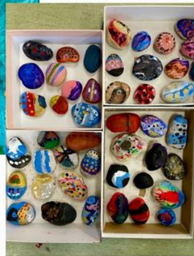
Patterns of the Ocean.

Year 1 and 2 students had lots of fun painting rocks in the style of Bronwyn Bancroft. We hope to see these rocks in a new sensory garden next term!