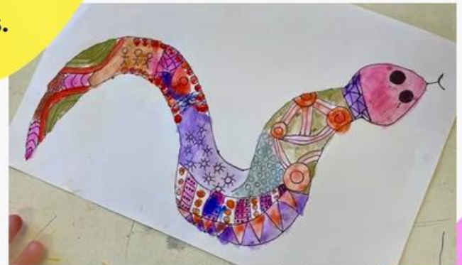
A very detailed snake by Sylvia