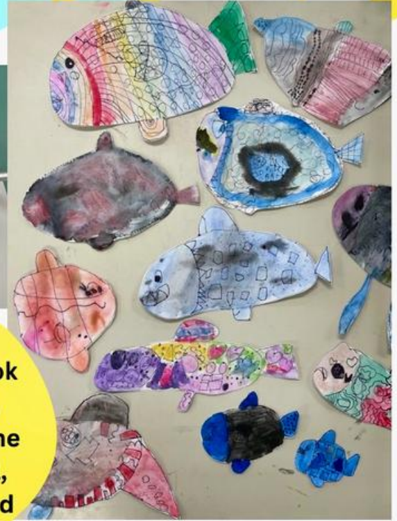
Fabulous Fish by Foundation H

Inspired by artist Bronwyn Bancroft's book 'Patterns of Australia', students drew the outline of an Australian animal, filled it with patterns and painted with water colours.