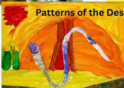
Patterns of the Desert.