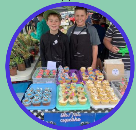
Develop Life Skills